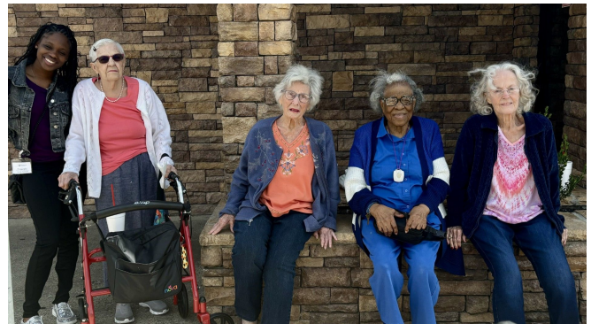
Enjoying a delicious lunch and great company at Kelley's Country Cookin' with the Lunch Bunch group.