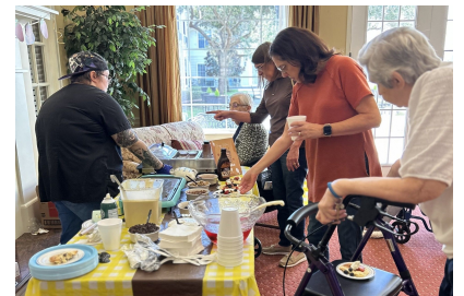
Flippin' delicious! Build your dream stack at our pancake bar!