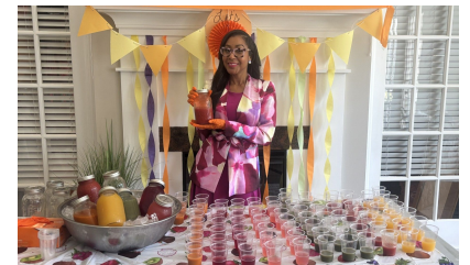
Sippin' and groovin' at Crystal's Juice Jam!